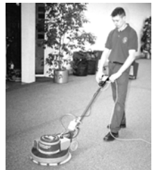
Carpets Dry in 30 minutes with the Dry Fusion™ system.

We have developed this plan to be the easiest, most cost effective and hassle free way for you to enjoy cleaner, brighter and healthier carpets all year round, year after year, and at no more cost than your annual cleaning bill. This package is designed for people who want to keep their carpets looking the very best all year round, with the benefit of having a specialist on call for emergency stain removal. The cost is spread over the year in small monthly payments. You get everything in the DEEP CLEAN & STAIN PROTECTION Package (which is discounted by 50% for your first clean) and we return in 6 months to carry out a FREE highlight clean of the main traffic areas. You also receive free Cleaning Doctor Unbelievable spot and stain remover and FREE Stain Removal Call Outs. If you are unable to remove a spot with our Unbelievable spot remover, we'll return and re-clean the area for free. This emergency call out service is unlimited while you are a member of our Perfect Care Maintenance Plan.