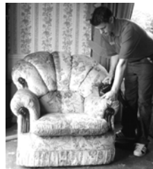
Upholstery, including leather cleaned & restored.