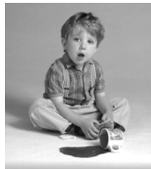
Stain Protector for carpets makes this less of a disaster.