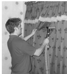
Curtains Cleaned in situation – there is no need to take them down.