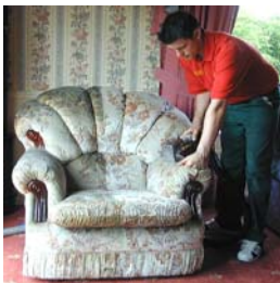
Upholstery and Soft Furnishings A deep extraction clean of your upholstery and soft furnishings highlights the colours and patterns.