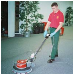
Dry Fusion Cleaning is a great low-moisture, quick-drying system for carpets, carpet tiles and rugs – domestic or commercial.