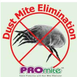
Allergy Sufferers Benefit from our Dust Mite elimination programme for carpets, upholstery and mattresses.