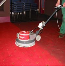
Carpets Dry in 30 Minutes With Dry Fusion your carpets are left clean, dry and ready-to-walk-on just 30 minutes after cleaning.