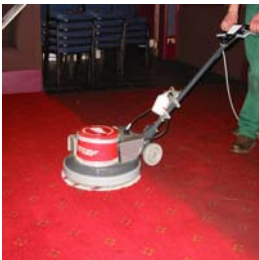
Carpets Dry in 30 Minutes With Dry Fusion your carpets are left clean, dry and ready-to-walk-on just 30 minutes after cleaning.