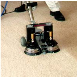
Deep Extraction Carpet Cleaning Cleaning right down to the base of your carpet to remove harmful grit, dirt, stains and pollutants.