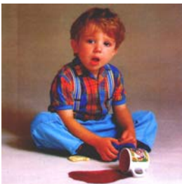
Stain Protection Stain protector applied to your carpets and soft furnishings makes this less of a disaster.