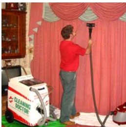
Curtain Cleaning Curtains, swags, tails and pelmets all cleaned on site – there is no need to take down for cleaning.