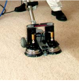
Deep Extraction Carpet Cleaning Cleaning right down to the base of your carpet to remove harmful grit, dirt, stains and pollutants.