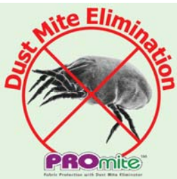
Allergy Sufferers Benefit from our Dust Mite elimination programme for carpets, upholstery and mattresses.